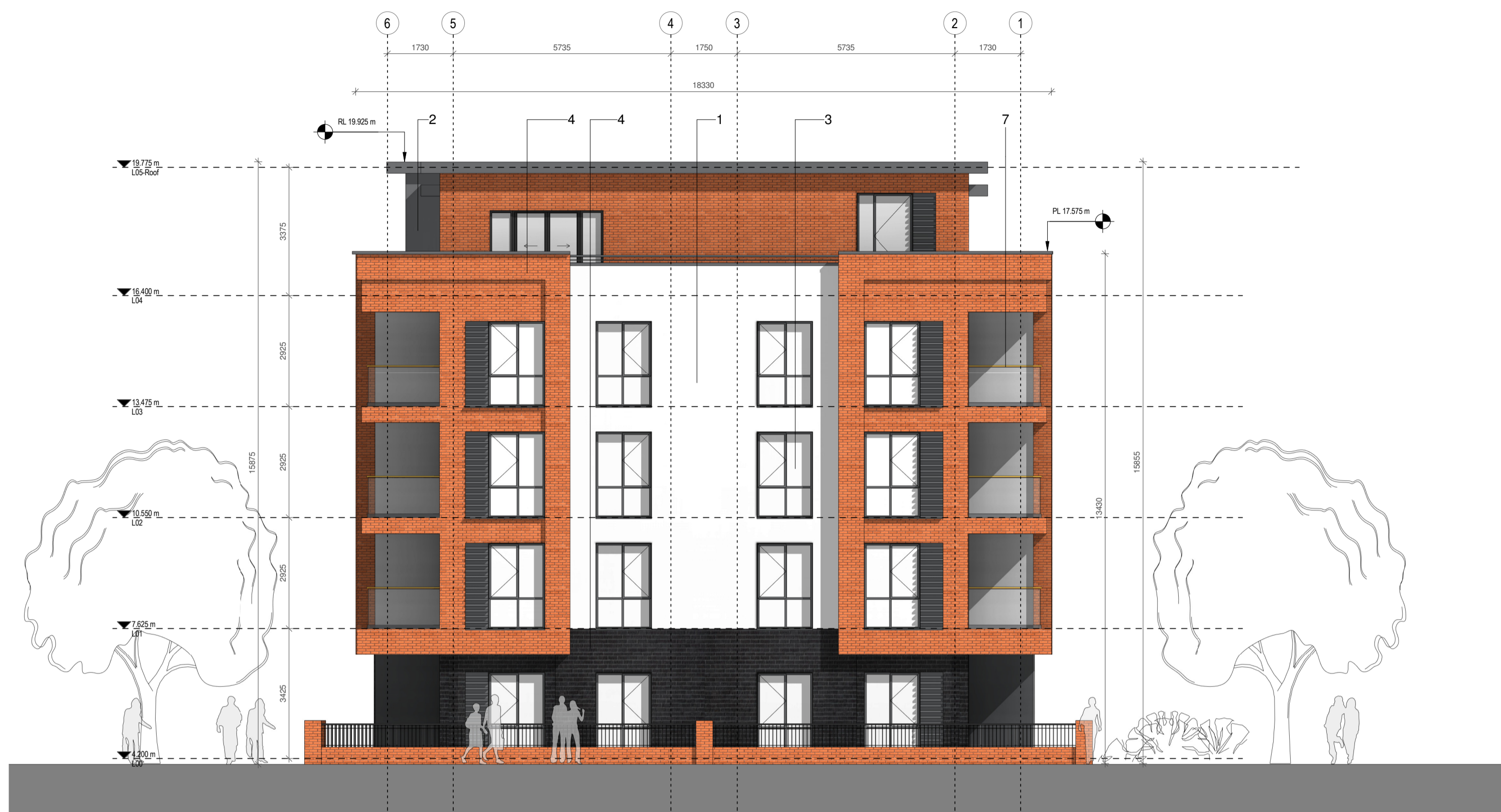
1 ELEVATION.A 1 : 100 1:200@A3