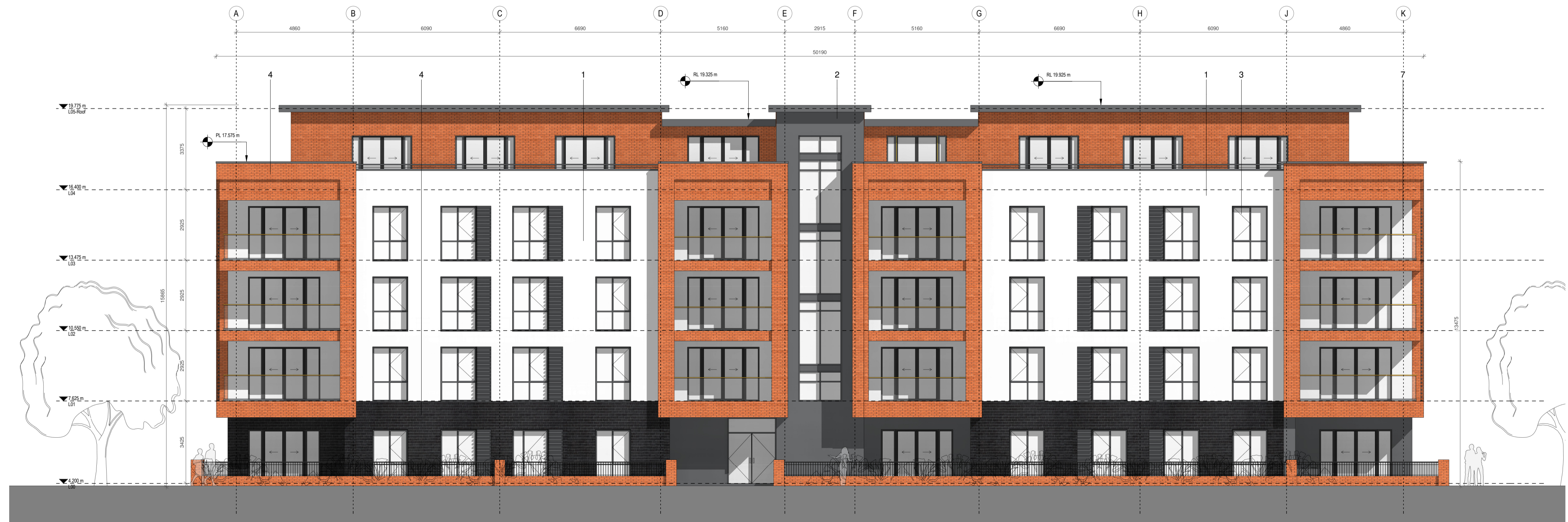
2 ELEVATION.B 1 : 100 1:200@A3

P03.04 12.03.18 BLR Issued to Planning Consultant for Review P03.03 02.02.18 JMC Issued to Planning Consultant for Review P03.02 12.01.17 BLR Issued for RFI P03.01 18.08.17 MFG Issued for Planning